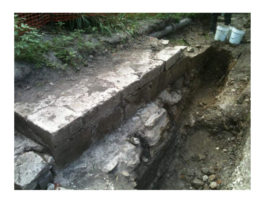
Upper Labor Dam

and that "San Antonio would never have become a major community without its irrigation system to distribute water resources."