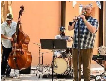
Dirty River Jazz Band

Participating brewers include Alamo Beer, Freetail Brewing, Texas Beer Co., Tuff Dog Brewing, Viva Beer, and Bexar Brewers, who will be offering samples of their tasty brews. Also offering samples will be Southside Soda.