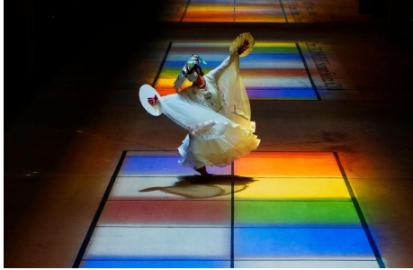
Specially produced performance piece by the Urban-15 Group