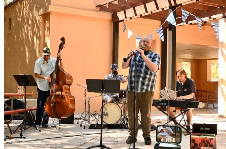
Dirty River Jazz Band will perform during the cocktail hour